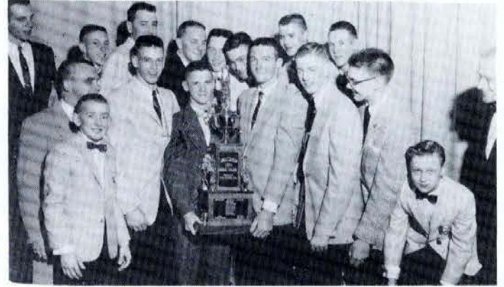
REGIONAL TOURNAMENT CHAMPS